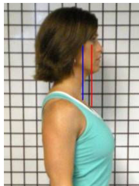
Good Head Posture