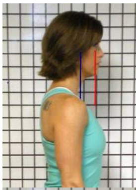
Forward Head Carriage

Have you ever noticed how many people have terrible posture? One of the most common faulty postures is called “forward head carriage” or “anterior based occiput.” Other terms are “hump back” or slouching. There are several reasons for this common postural fault. One is the weight of the head is, on average, approximately 10-13 pounds and if it’s positioned too far forwards, the muscles in the upper back and neck tighten up much more than normal, fatigue and become painful. Also, the muscles that attach to the skull have different degrees of strength. They also attach and pull at different angles, contributing to the common forward head carriage posture. The muscle of the chest are much stronger than those in the mid and upper back and tend to pull our shoulders forward. The following pictures offer a good view of both a faulty posture as well as a “good” posture. Notice the forward shift in the line in the pictures of poor posture and backwards shift in the good posture pictures.